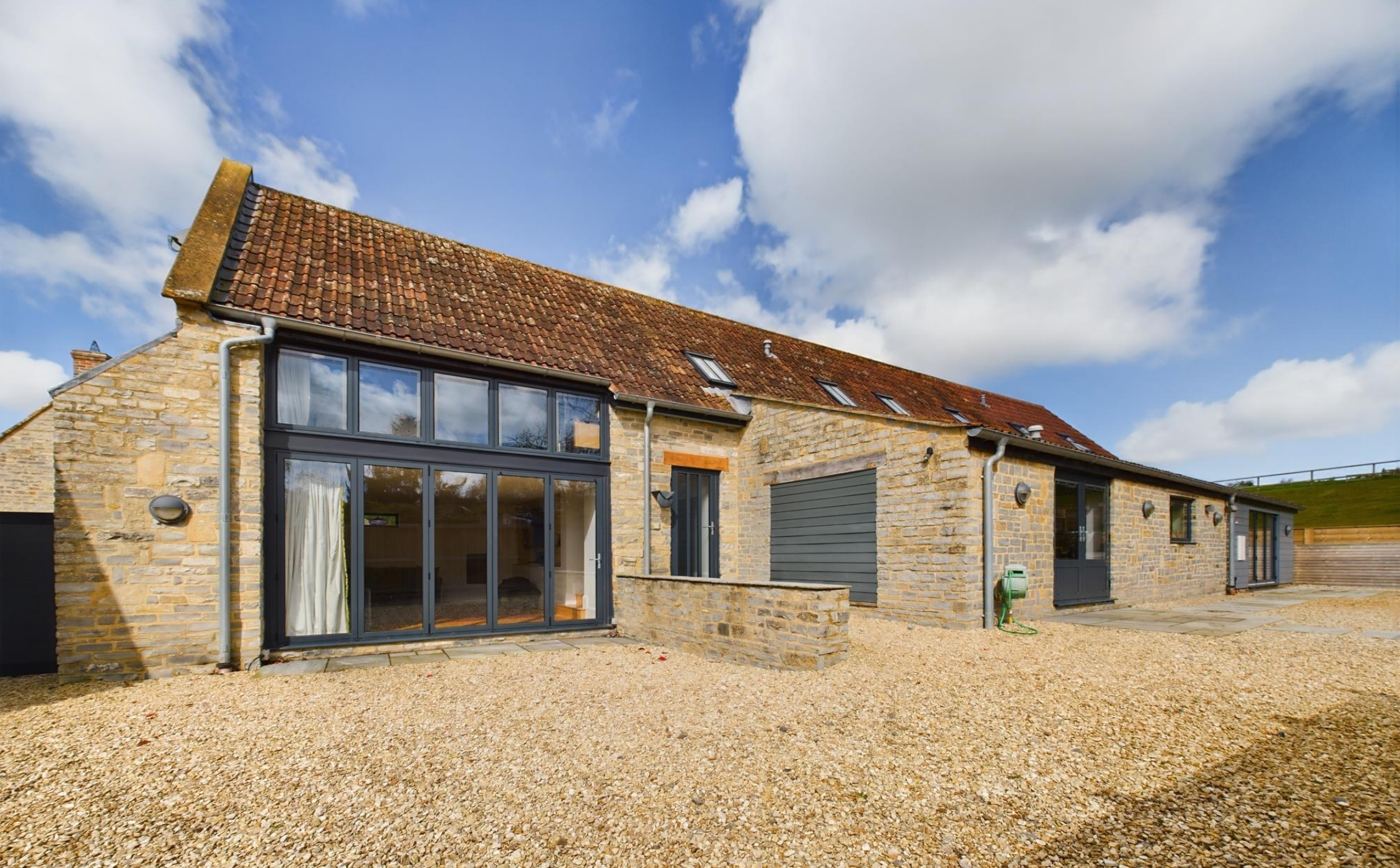
Hillside Barn Pitney, TA10 9AQ